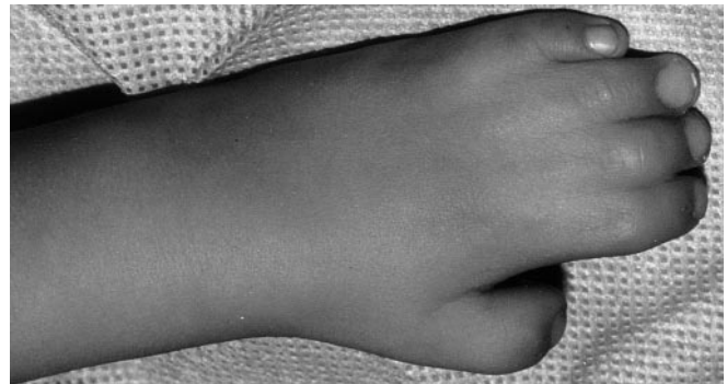
Fig. 1 Ipsilateral hand deformity

This boy with Poland's syndrome had unilateral absence of the breast and nipple, this is a very rare entity. This case emphasizes many relatively rare features of Poland's syndrome.